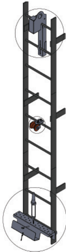
LOWER FIXED LADDER

Formetco developed the only system that protects the worker from the ground through the transition to the upper catwalk.