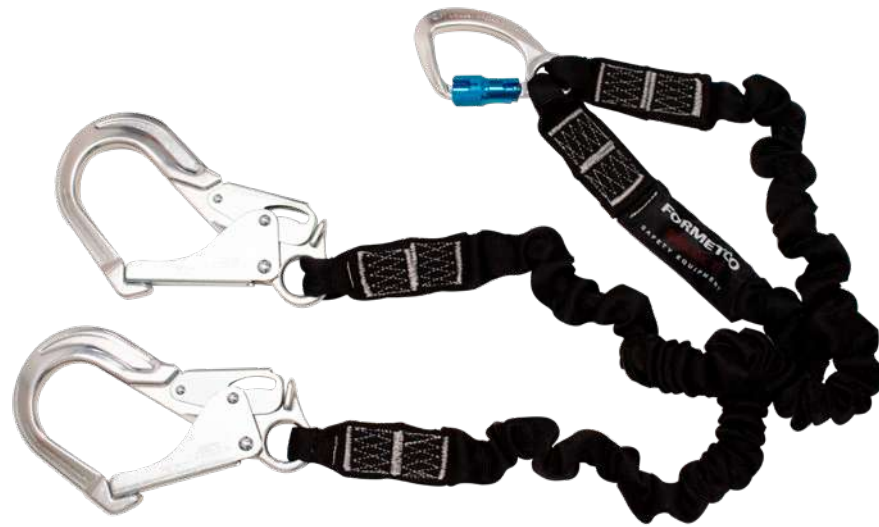
ALUMINUM REBAR HOOKS