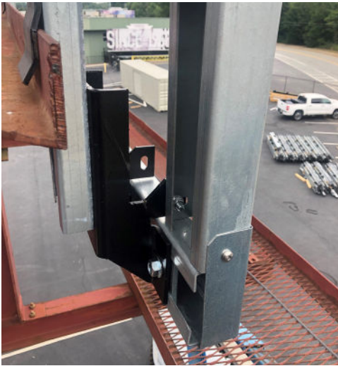
Bottom Perimeter Frame Bracket