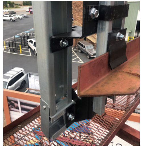
Side Perimeter Frame Bracket