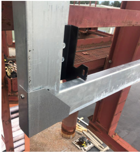
Perimeter Frame Corner Cap