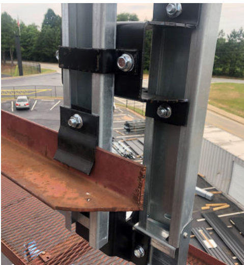
Stringer Hanger Clip