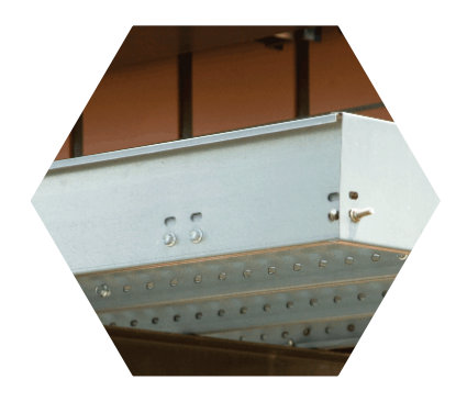
4" kickrails provide a safe and secure working platform